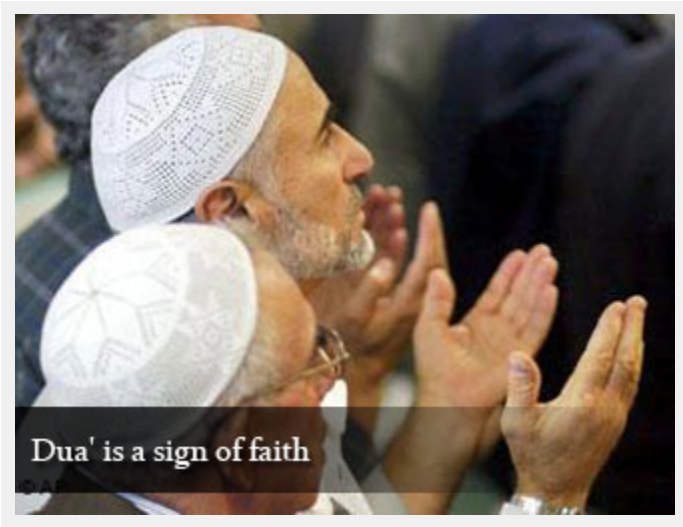
Dua' is a sign of faith

The subtlest aspect here is that Allah the Almighty says: